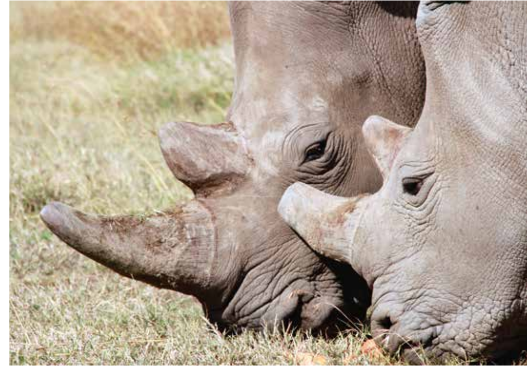
From right to left: Najin and Fatu, the last two surviving female northern white rhinoceroses in the world at Ol Pejeta Conservancy in Laikipia; a huge baobab tree, Tsavo East National Park; Maasai men dressed in traditional clothing

Around October, they repeat it all on their return to the Serengeti. Unsurprisingly, the Mara is far more crowded during the migration, and this is when neighboring conservancies come into their own. Away from the crowds, they may be further from the river, but many will offer full-day game drives for the experience.