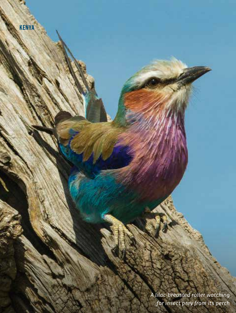
A lilac-breasted roller watching for insect prey from its perch